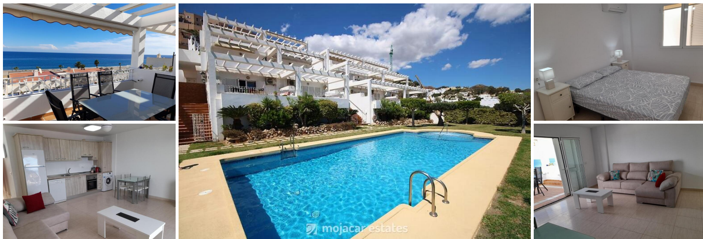
Bajos del Bancal Luna

Lovely front line apartment with superb sea views in community with swimming pool and gardens.