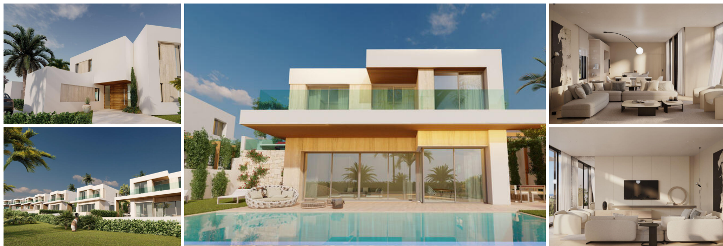
Detached house with panoramic sea and golf views - Estepona

Situated in the esteemed western sector of Estepona, the Villa boasts direct access to the principal artery of the Costa del Sol the A-7 motorway effectively drawing you closer to the dynamic heart of Estepona and its pivotal amenities, bars, restaurants, etc., while also offering convenient proximity to iconic locales such as Puerto Banús, Marbella, and Malaga.