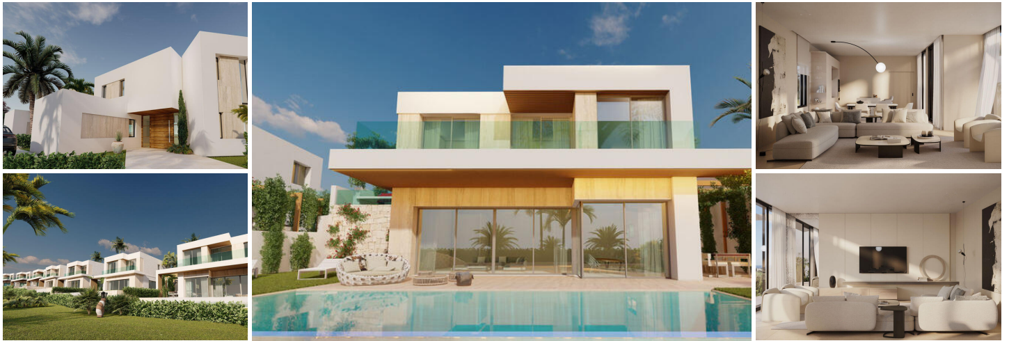
AZATA Villa - detached house with panoramic sea and golf views - Estepona

Situated in the esteemed western sector of Estepona, AZATA Villa boasts direct access to the principal artery of the Costa del Sol the A-7 motorway effectively drawing you closer to the dynamic heart of Estepona and its pivotal amenities, bars, restaurants, etc., while also offering convenient proximity to iconic locales such as Puerto Banús, Marbella, and Malaga.