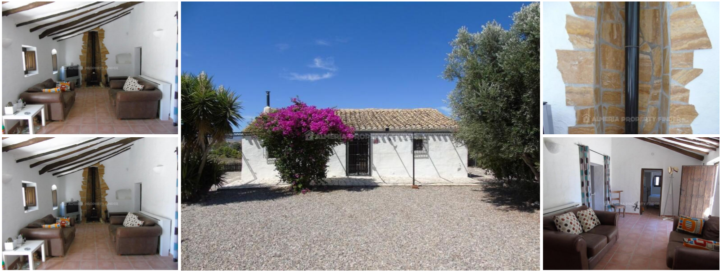
Cortijo Elena - A country house in the Albox area. (Renovated)

**EXCLUSIVE TO ALMERIA PROPERTY FINDER**