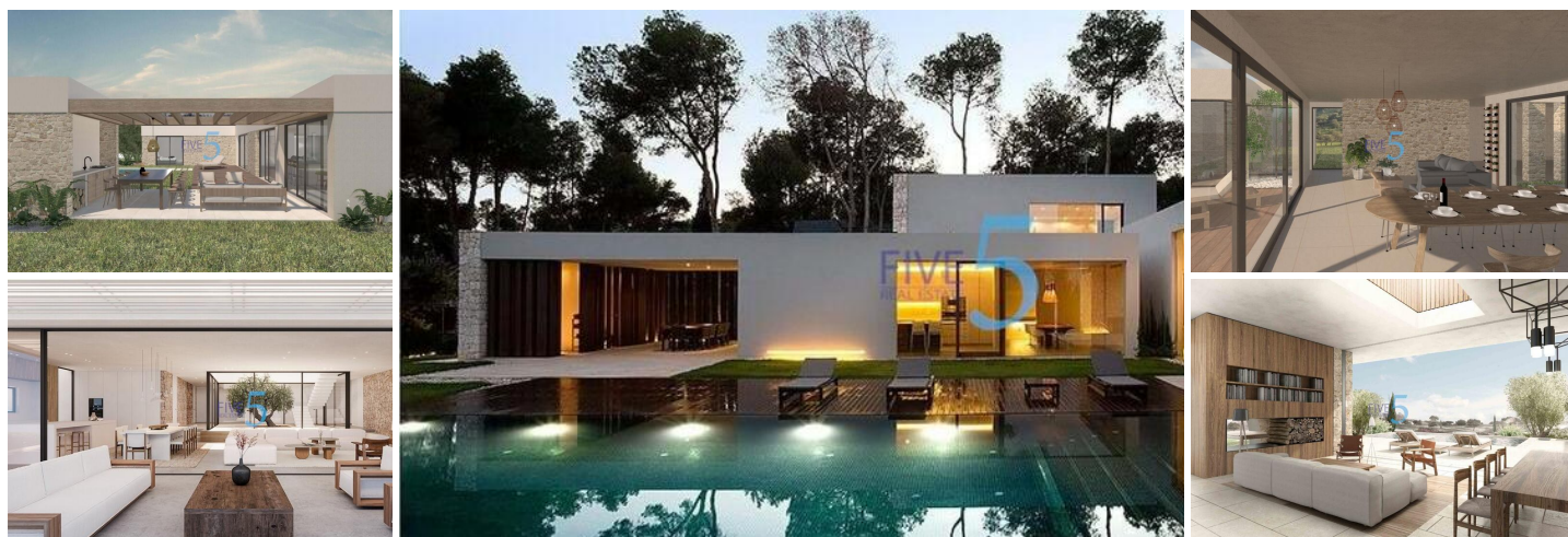
NEW BUILD VILLA IN YECLA, MURCIA

New Build exclusive luxury villa located within a beautiful vineyard in Yecla, Murcia.