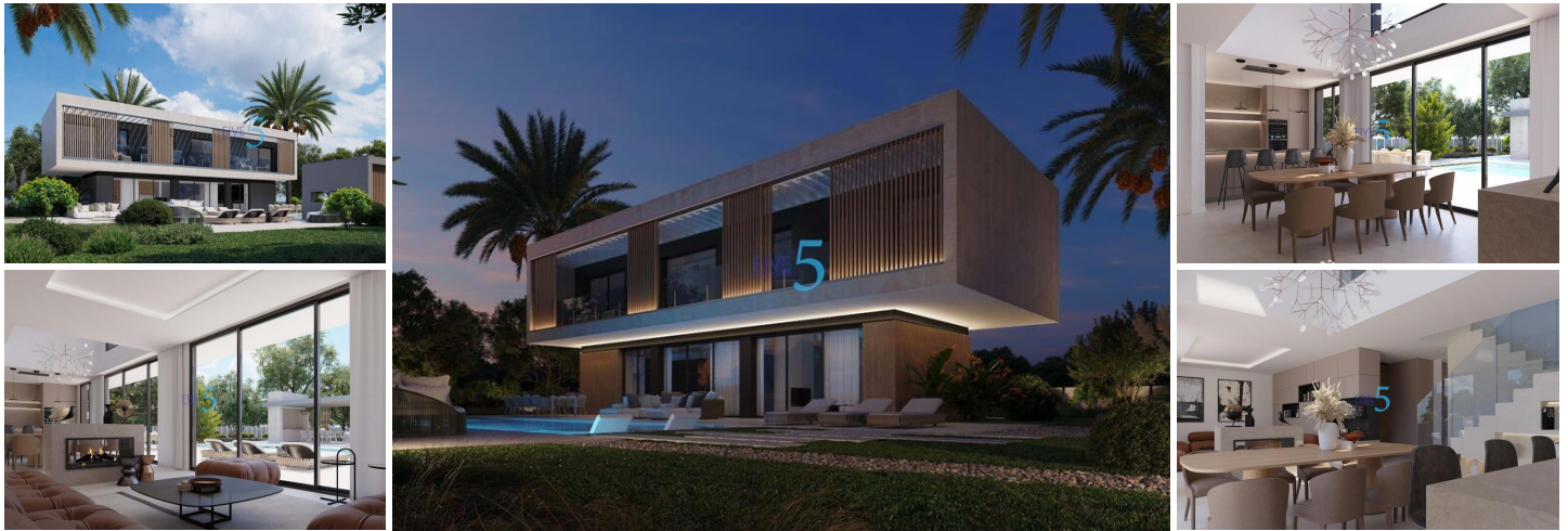
NEW BUILD VILLA IN JAVEA