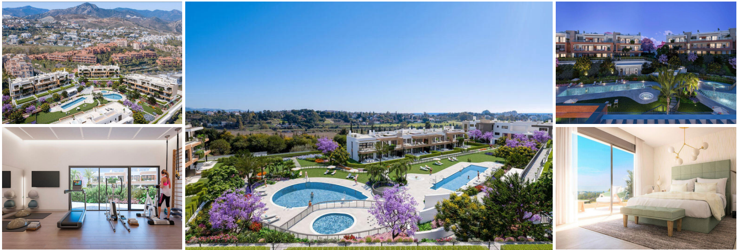
ELEONOR middle floor apartment - South facing and New construction - Estepona / Atalaya

The apartment is ideally located in the Atalaya area in Estepona, close from the prestigious Atalaya golf, Atalaya international school, shops and only few minutes away from Puerto Banus.