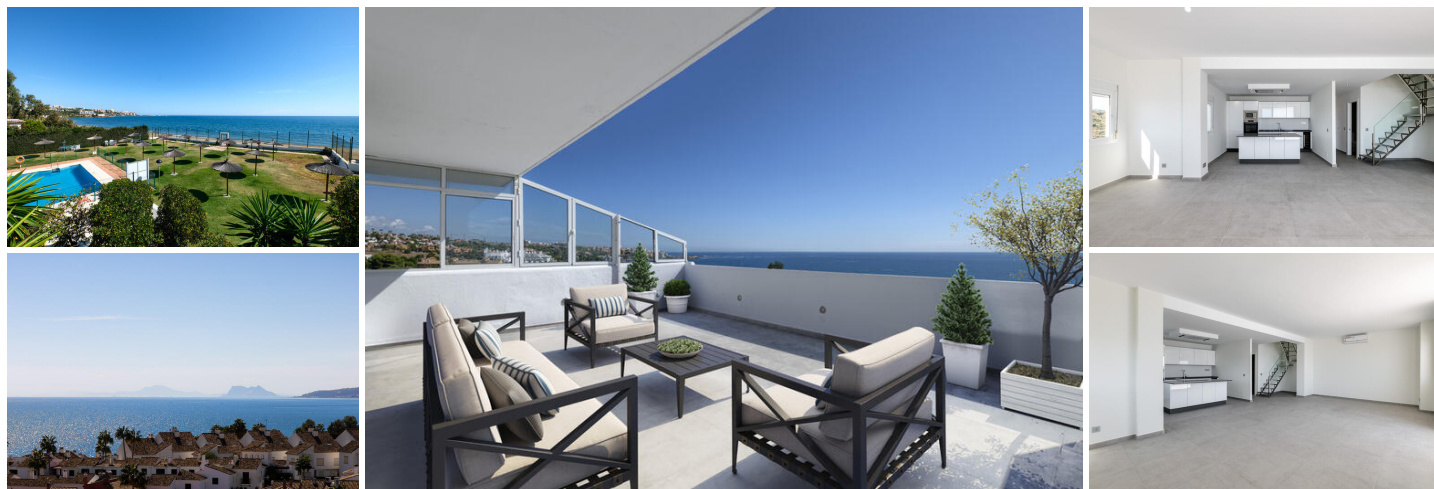
Duplex Penthouse beachfront - Estepona

Just outside Estepona, on the first line of the sea, we present to you this apartment with incredible views of the Mediterranean, Gibraltar and the African coasts.