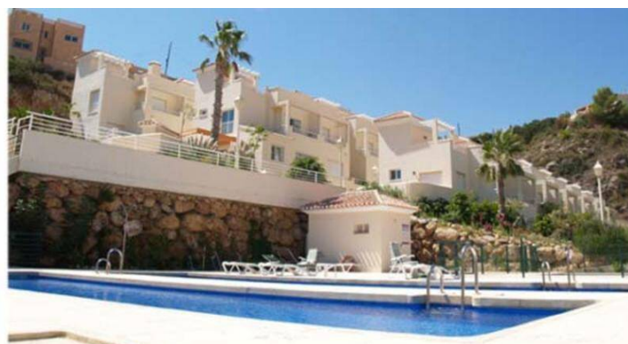
RESIDENCIAL LA ATALAYA 23 BROWN DAS ADOSADAS CON GARAJES, ZONAS COMUNES Y PISCINAS COMUNITARIAS PROMOTORA: EL PINAR DE BEDAR, S.A.