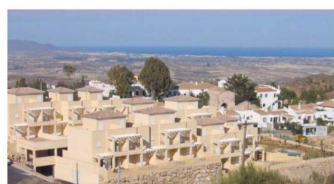
RESIDENCIAL LA FUENTE 4 VILLAS ADOSADAS CON GARAJE, ZONAS COMUNES Y PISCINA COMUNITARIA. PROMOTORA: EL PINAR DE BEDAR, S.L.