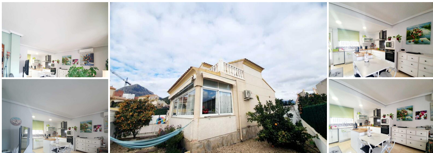
VILLA IN POLOP DE LA MARINA

Detached house in Polop, close to the commercial centre of Alberca, where there is supermarket, pharmacy, commercial premises and bar, restaurant, also there is fantastic park for all the family.