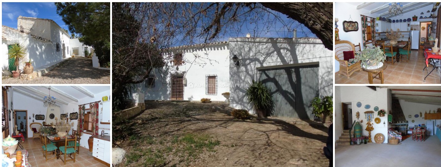
Cortijo Rosenda - A country house in the Albox area. (Resale)

A large detached country house with a build of 350m 2 located on the outskirts of the popular village of Las Pocicas. The village has a small shop, bakery, bar, doctors and municipal swimming pool (open during summer months) and a primary school.