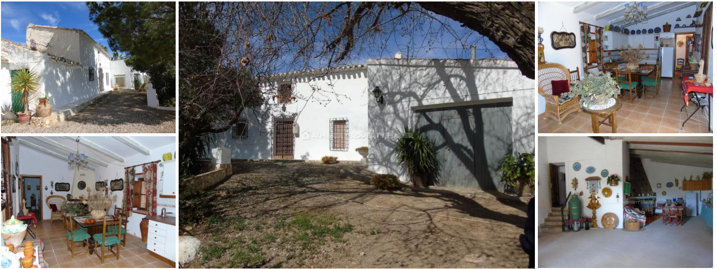
Cortijo Rosenda - A country house in the Albox area. (Resale)

A large detached country house with a build of 350m 2 located on the outskirts of the popular village of Las Pocicas. The village has a small shop, bakery, bar, doctors and municipal swimming pool (open during summer months) and a primary school.