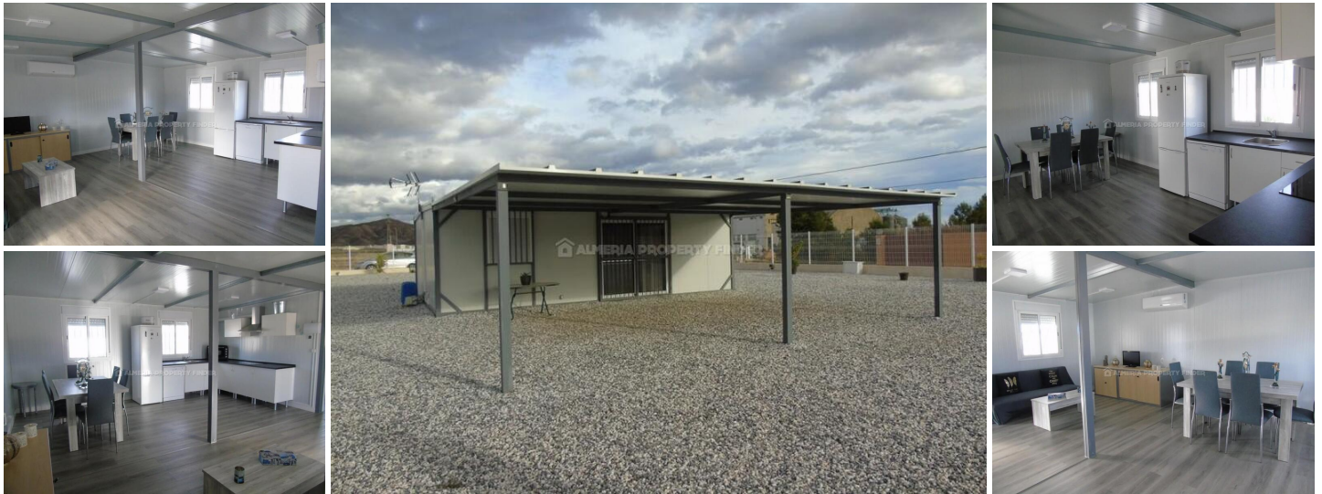
Casa Tomas - A park home in the Albox area. (Resale)

*** EXCLUSIVE TO ALMERIA PROPERTY FINDER ***