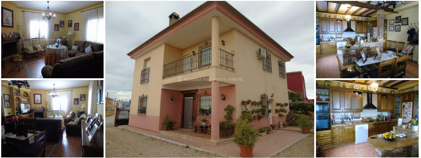
Villa Barca - A villa in the Albox area. (Resale)

A fabulous modern two storey fully furnished detached three bedroom, two bathroom house with a build of 190m 2 located in the area of Locaiba, Albox. The property is in a fabulous location approximately 3 minutes to the town of Albox, which offers all amenities including a wide range of shops, supermarkets, cafes, tapas bars, restaurants, schools, banks, post office, sports facilities, a 24 hour medical centre and two weekly markets. There is good access to the motorway for the rest of the Almanzora Valley, the coast and airports of Almeria, Alicante and Murcia.