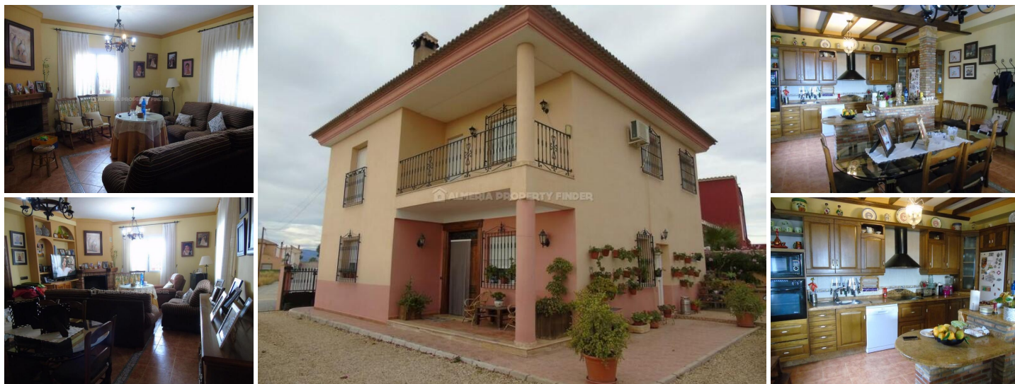
Villa Barca - A villa in the Albox area. (Resale)

A fabulous modern two storey fully furnished detached three bedroom, two bathroom house with a build of 190m 2 located in the area of Locaiba, Albox. The property is in a fabulous location approximately 3 minutes to the town of Albox, which offers all amenities including a wide range of shops, supermarkets, cafes, tapas bars, restaurants, schools, banks, post office, sports facilities, a 24 hour medical centre and two weekly markets. There is good access to the motorway for the rest of the Almanzora Valley, the coast and airports of Almeria, Alicante and Murcia.