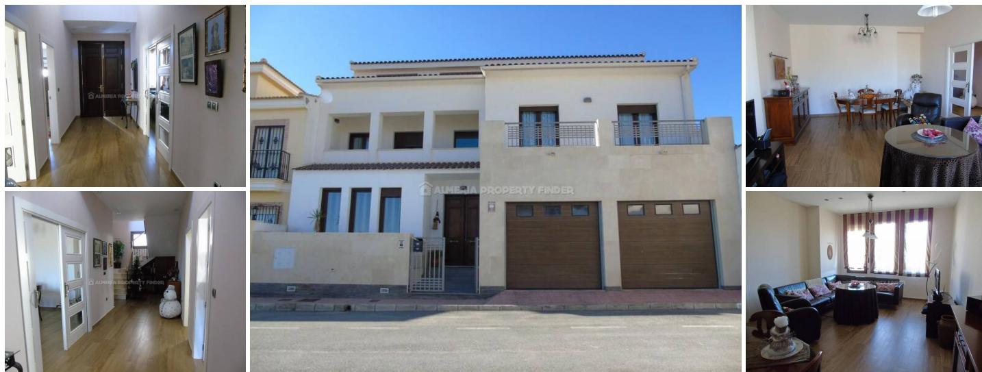
Casa Moderno - A town house in the Albox area. (Resale)

Large modern 5 bedroom, 4 bathroom townhouse with garage situated in the popular market town of Albox. With a generous build size of 385m 2 , this bright & spacious 3 storey property would make an ideal B&B / guest house or a lovely family home. The property is situated within easy walking distance of all amenities including shops, supermarkets, schools, cafes, tapas bars, restaurants, sports facilities and a 24 hour medical centre.