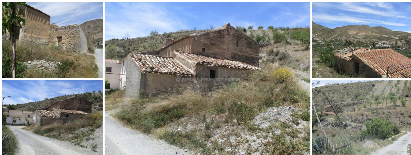
Ruina de los Adrianes - A country house in the Oria area. (Complete Ruin)

Fabulous two storey cortijo for complete renovation, situated in a beautiful rural hamlet in the Rambla de Oria area, within walking distance of a bar and around 15 minutes drive from the town of Oria which offers all amenities.