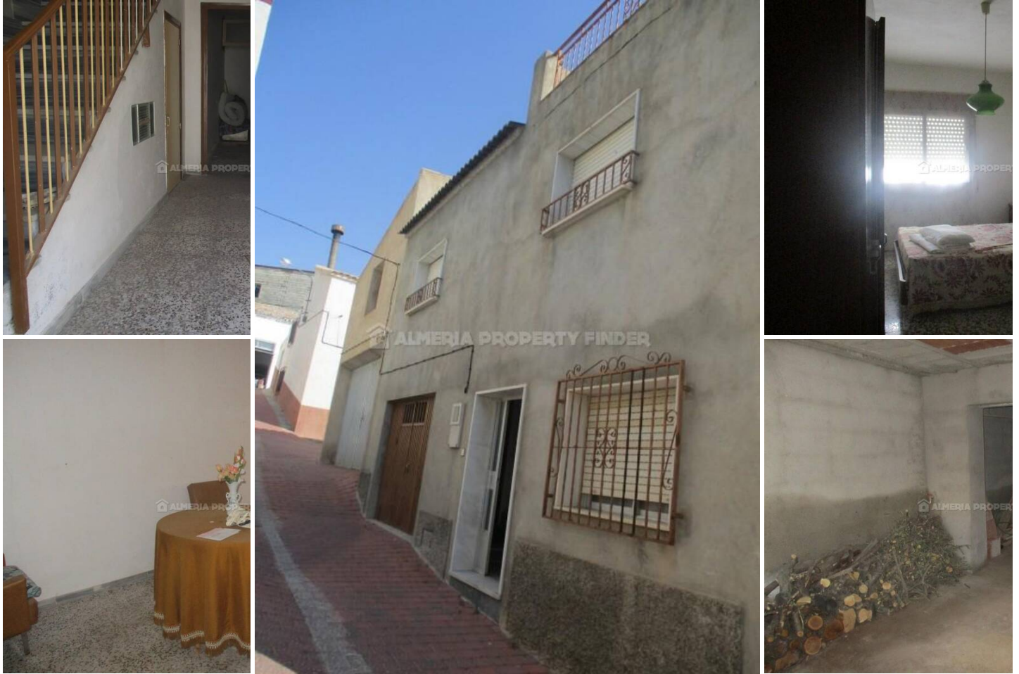
Casa del Vecino - A town house in the Oria area. (Habitable)

Habitable 3 bedroom townhouse for sale in Almeria Province, situated in the traditional town of Oria within walking distance of amenities.