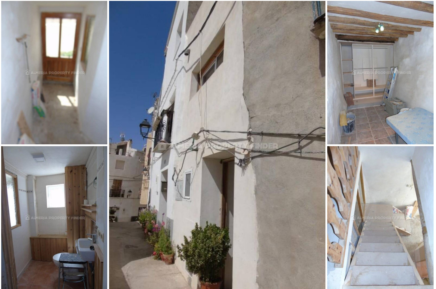
Casa Quesadas - A town house in the Seron area. (Partially Reformed)

Part renovated three storey 2 bedroom town house for sale in Almeria Province, situated in the typically Spanish hillside town of Seron.