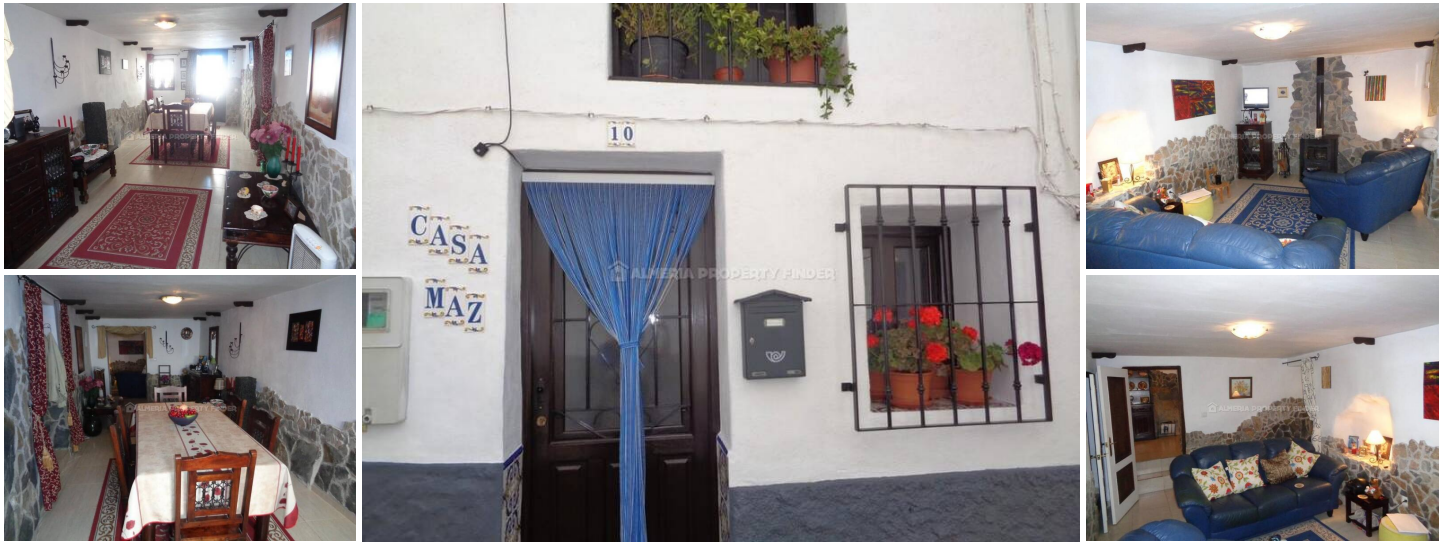
Casa Maz - A town house in the Somontin area. (Renovated)

Fully renovated 4 bedroom townhouse with garden for sale in Almeria, situated in the typically Spanish hillside town of Somontin, within walking distance of amenities.