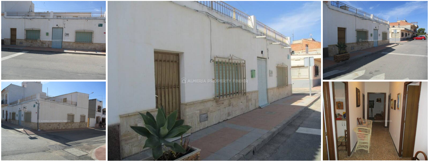
Casa Granada - A town house in the La Alfoquia area. (Habitable)

Habitable 3 bedroom town house for sale in Almeria Province, situated in the lovely town of Alfoquia which offers all amenities for daily living including shops, banks, cafes, tapas bars, restaurants, and medical facilities. The town has excellent access to the coastal motorway and is less than 30 minutes from the coast and 1 hour from Almeria airport.