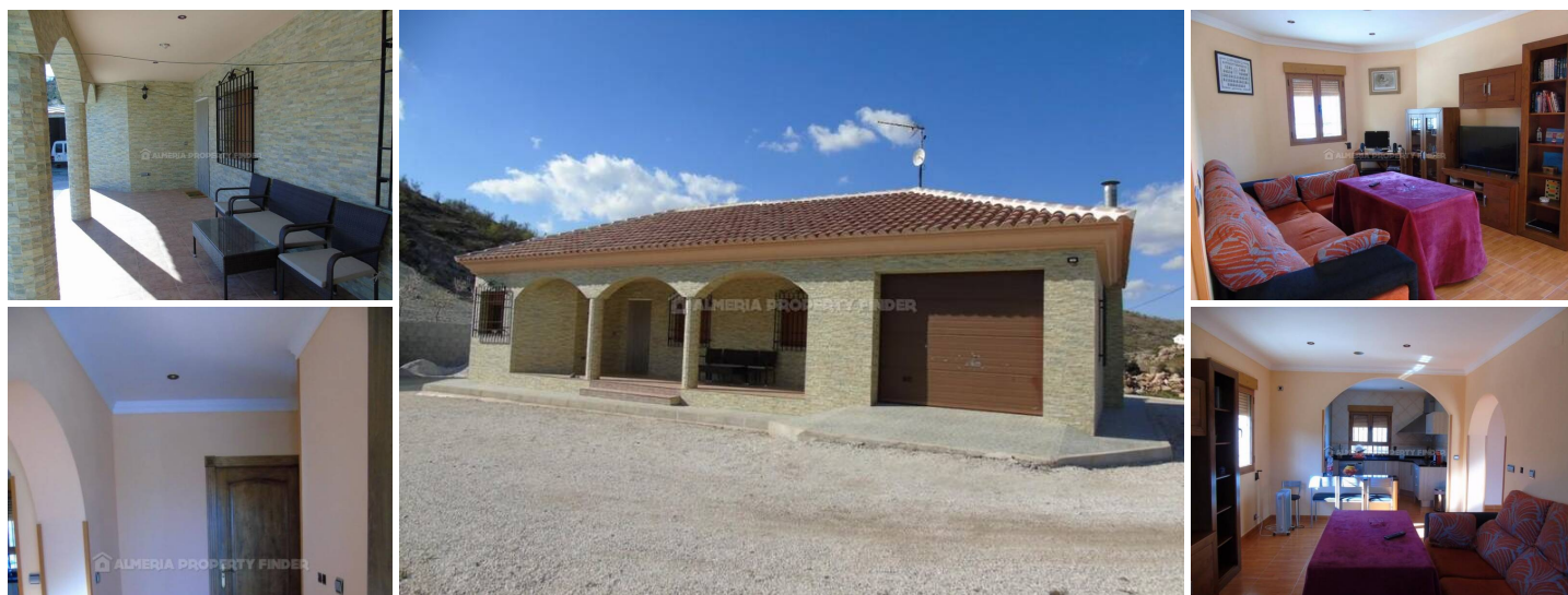
Villa Topas - A villa in the Oria area. (Resale)

Delightful 3 bedroom villa with integral garage and stunning views, situated in a tranquil rural area, 1km from the sleepy village of los Cerricos. The village offers basic amenities including tapas bars and a shop, and there are regular delivery vans offering bread, fish, meat and frozen goods. The small town of Chirivel is a 14 minute drive and the town of Oria is a 20 minute drive.