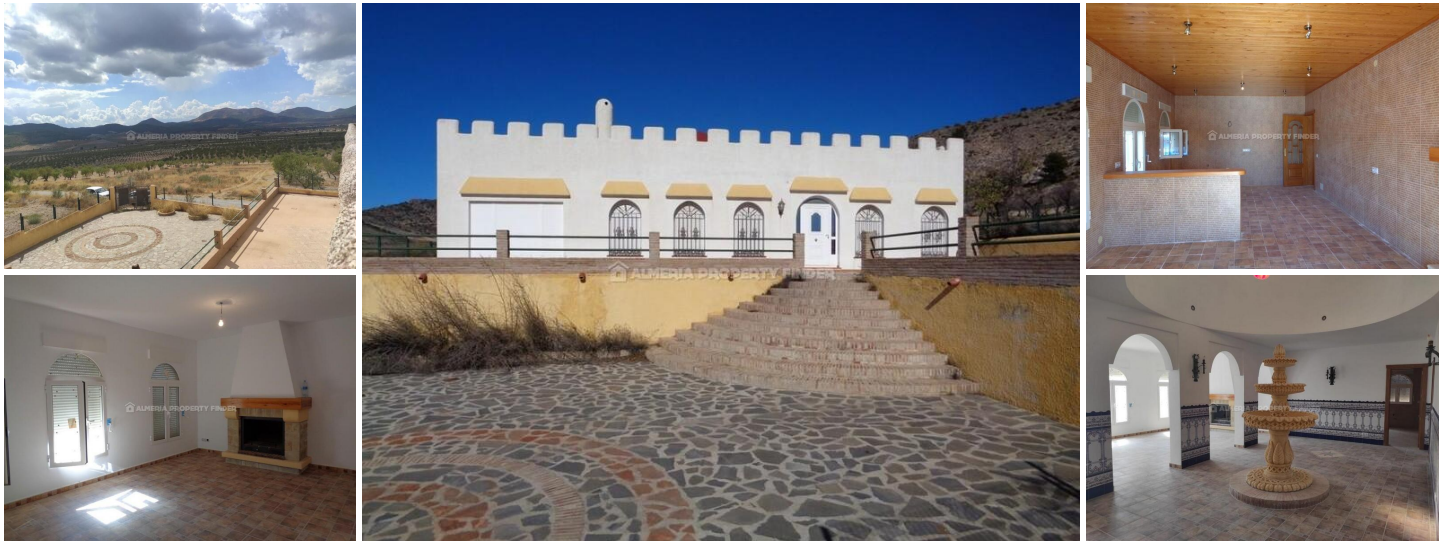
Villa Fuente - A villa in the Oria area. (Newly Built)

A great, unique new built 4 bedroom, 2 bathroom villa for sale in the Oria area, set in a walled and gated plot of around 1000m 2 with a swimming pool and garage.