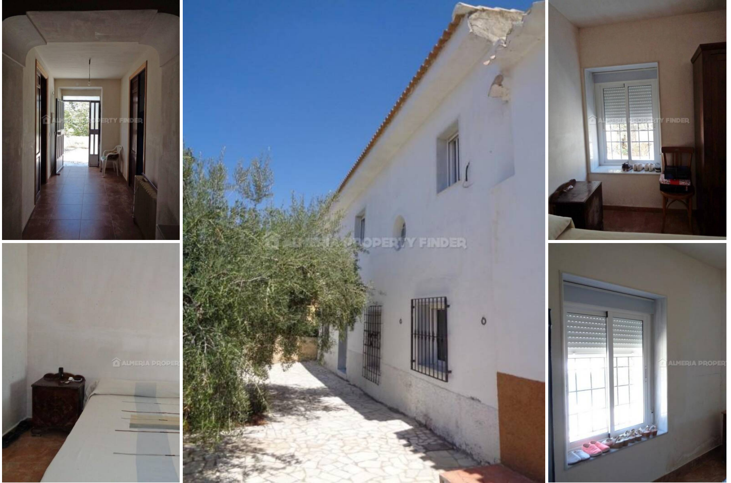
Cortijo Marques - A country house in the Albox area. (Renovated)

Fully renovated 7 bedroom cortijo for sale in Almeria Province, situated just outside the thriving market town of Albox. This 2 storey terraced property has a build size of around 200m 2 , and is set in a plot of around 4000m 2 , with an additional separate plot of 30.000m 2 included in the price.