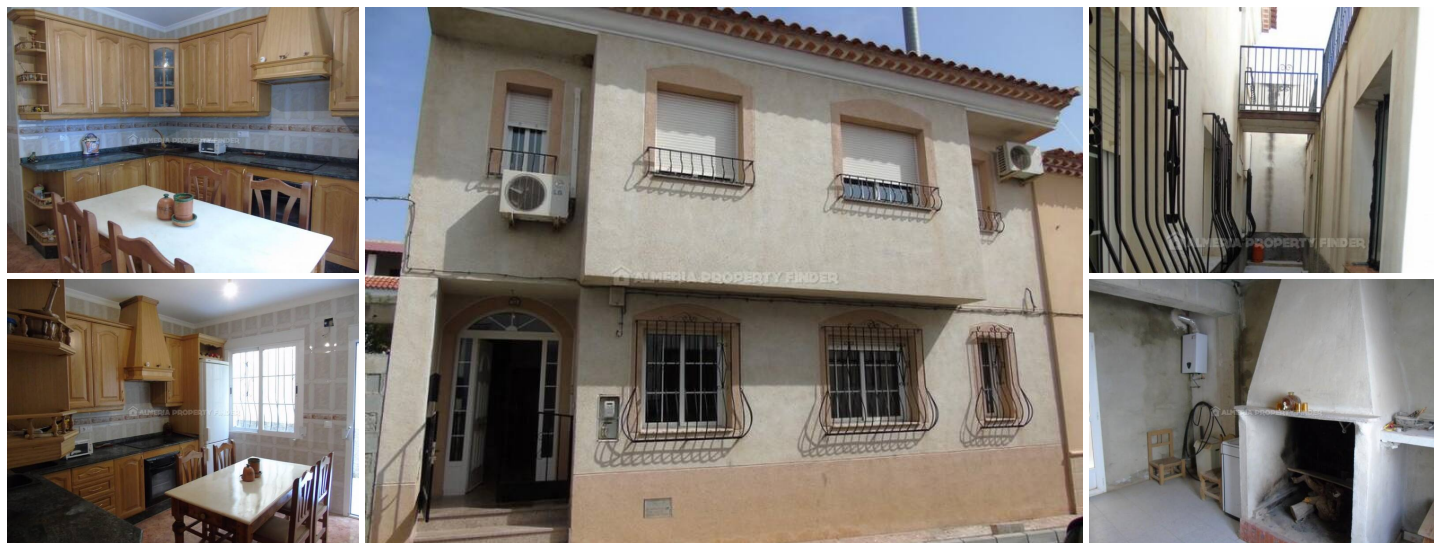
Casa Gloria - A town house in the Chirivel area. (Resale)

Fabulous 5+ bedroom townhouse situated in the lovely town of Chirivel which offers all amenities for daily living. The town has excellent access to the A92 motorway which leads to Granada and the Sierra Nevada ski resort in one direction, and to the coastal motorway and airports of Almeria, Murcia and Alicante in the other direction.