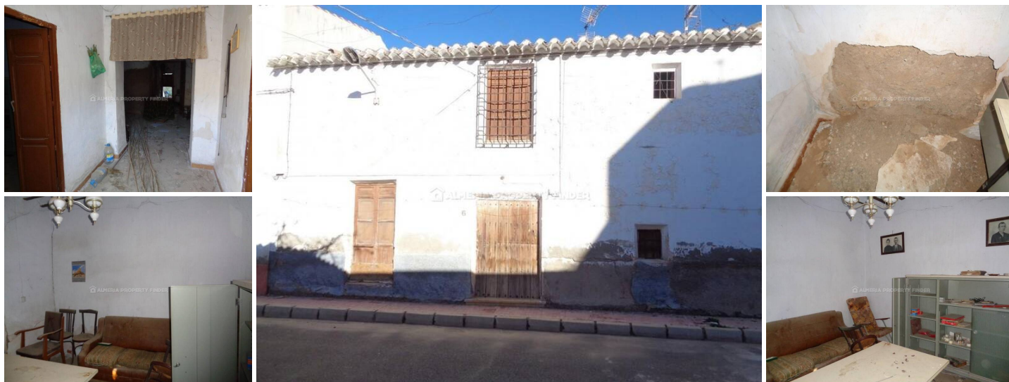
Casa Olivia - A village house in the Albox area. (For Renovation)

Large two storey village house with small garden for complete renovation. This terraced house for sale in Almeria Province is situated in a small village with basic amenities including a bar, bakery and pharmacy. The village is only 10 minutes from the large town of Albox which offers all amenities including shops, supermarkets, banks, schools, cafes, bars, restaurants, sports facilities and a 24 hour medical centre.