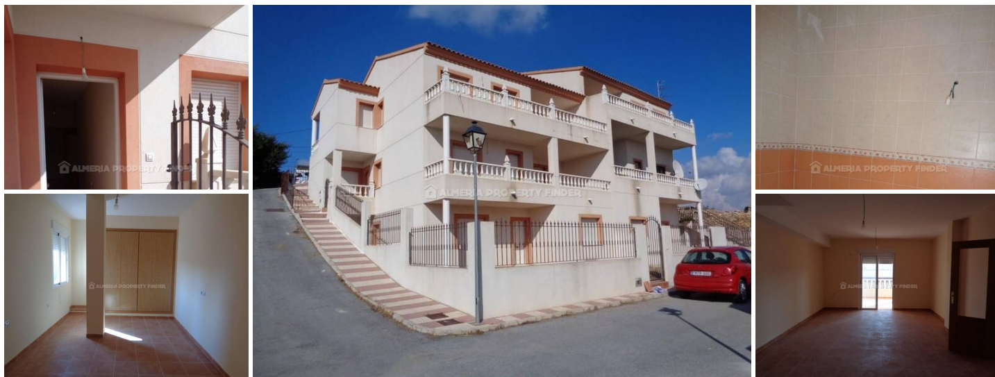
Apartamento Lazaro 3 - An apartment in the Cantoria area. (Newly Built)

Three bedroom apartment for sale in Almeria, set in a small new development on the edge of the pretty village of Almanzora.