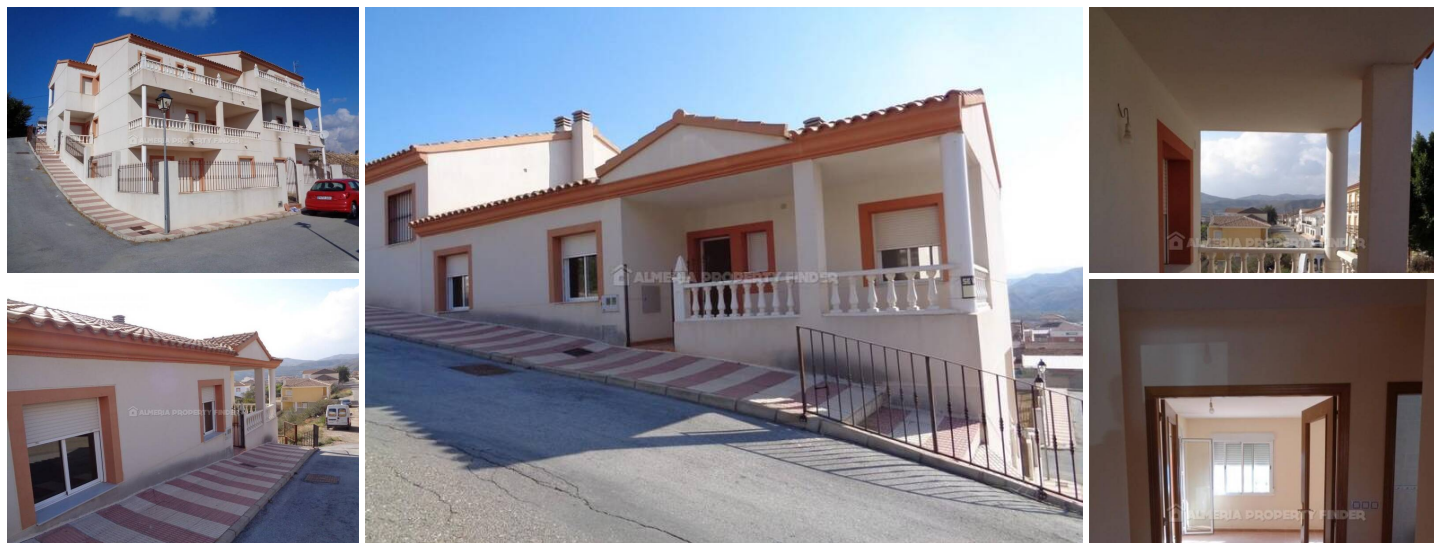
Apartamento Lazaro 1 - An apartment in the Cantoria area. (Newly Built)

REDUCED! Three bedroom apartment for sale in Almeria, set in a small new development on the edge of the pretty village of Almanzora.