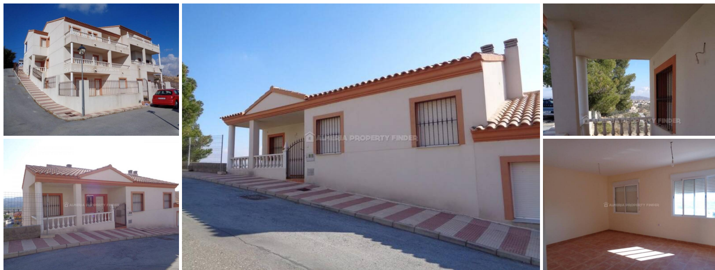
Apartamento Lazaro 2 - An apartment in the Cantoria area. (Resale)

Three bedroom apartment for sale in Almeria, set in a small new development on the edge of the pretty village of Almanzora.