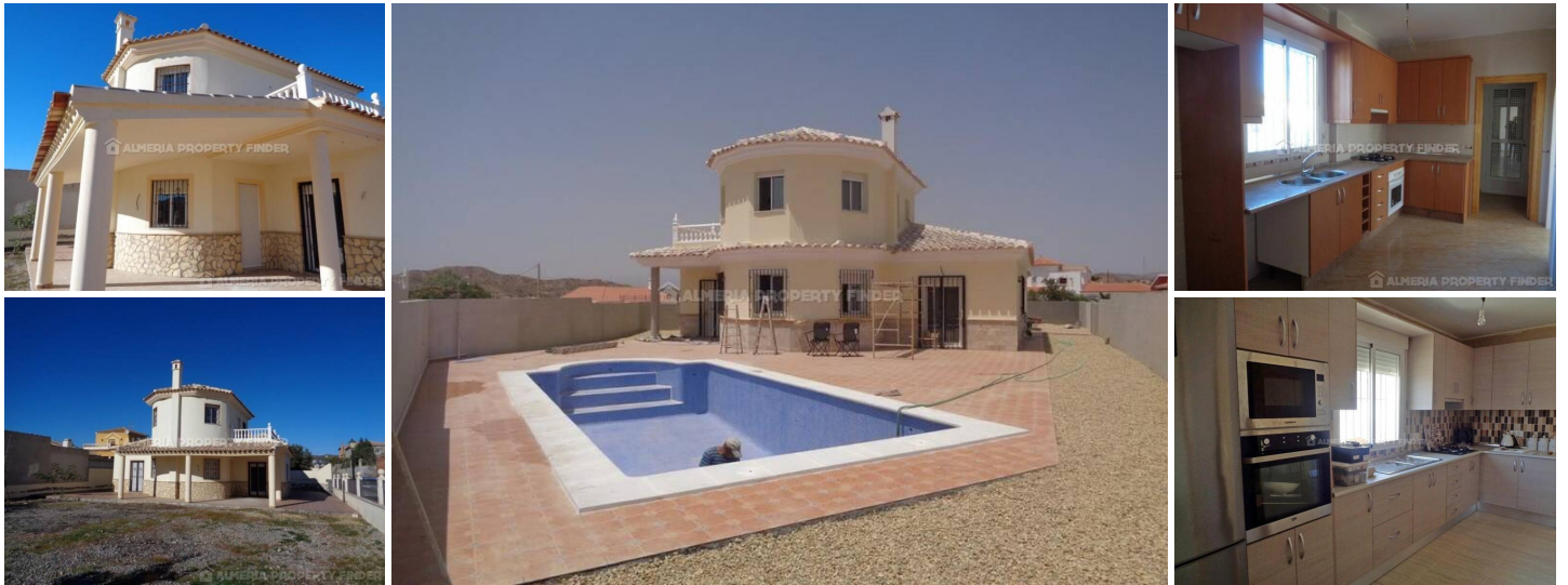
Villa Antonietta 3 - A villa in the Arboleas area. (Off Plan)

Off plan : Spacious 3 bedroom, 3 bathroom villa to be constructed on the edge of the popular village of Arboleas.