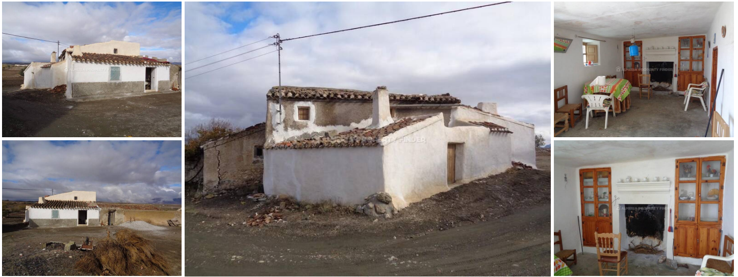
Casa Umbria - A country house in the Oria area. (For Renovation)

Situated on the edge of a small peaceful hamlet in the Oria area, this semi-detached country house for sale in Almeria Province is in need of renovation to become a cosy 2 bedroom house with a fantastic outlook across open countryside.