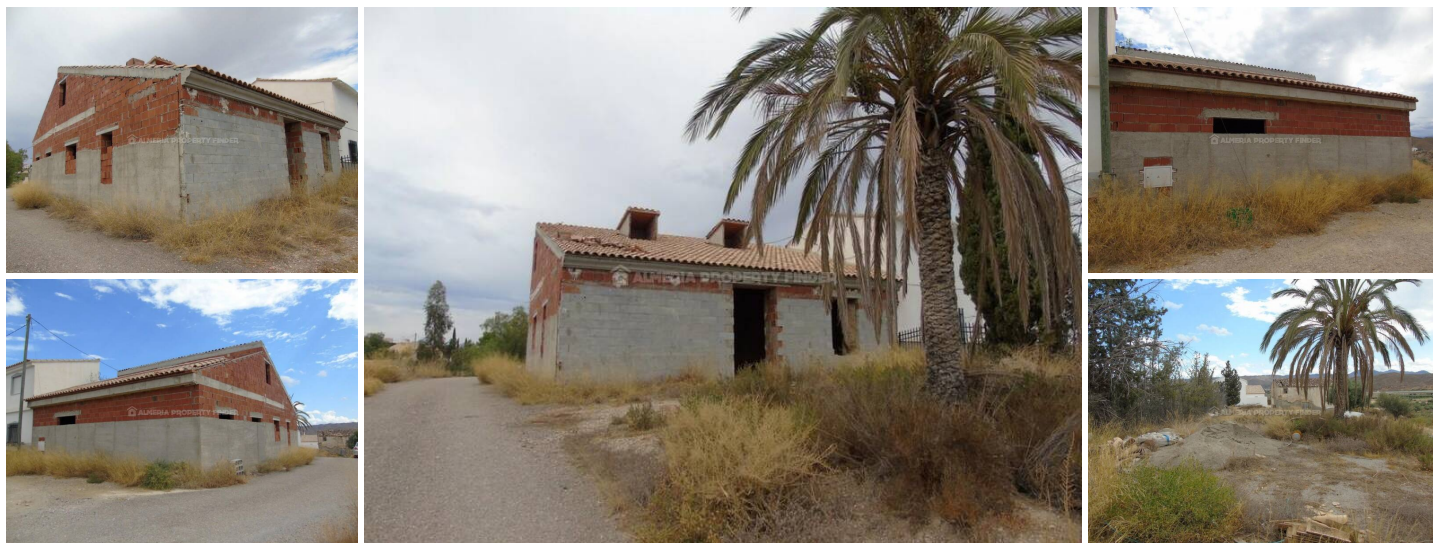
Casa Canico - A country house in the Albox area. (Under Construction)

Building project for completion: This part built semi-detached country house is in need of completion throughout including all plumbing & electrical installations, rendering and plastering, windows & doors, floors, plus the fitting of a kitchen and bathroom suite.