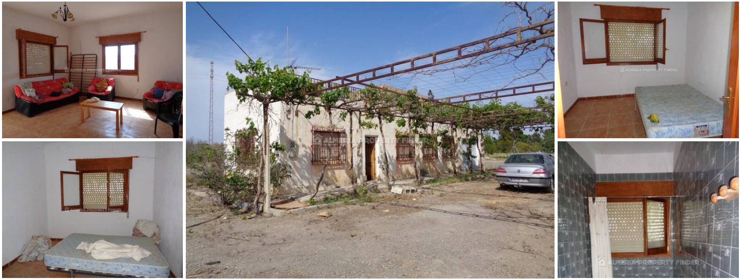
Cortijo Cecilia - A country house in the Partalóa area. (Partially Reformed)

Detached 3 bedroom country property with outbuildings, set in land of just over 10.000m 2 .