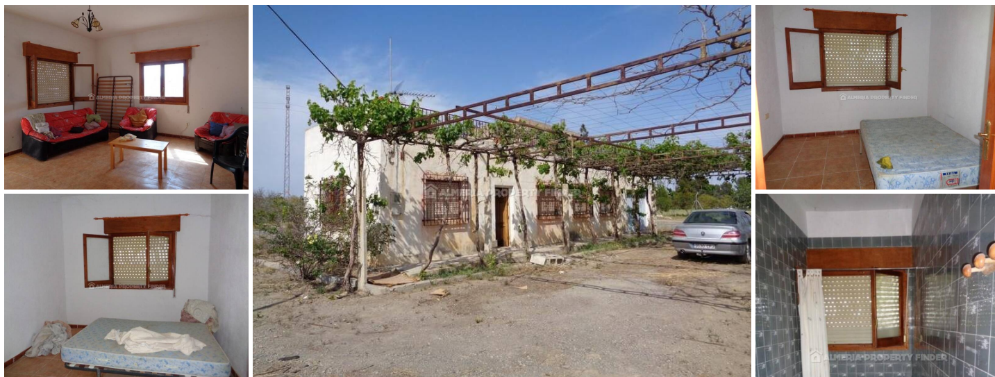
Cortijo Cecilia - A country house in the Partaloea area. (Partially Reformed)

Detached 3 bedroom country property with outbuildings, set in land of just over 10.000m 2 .