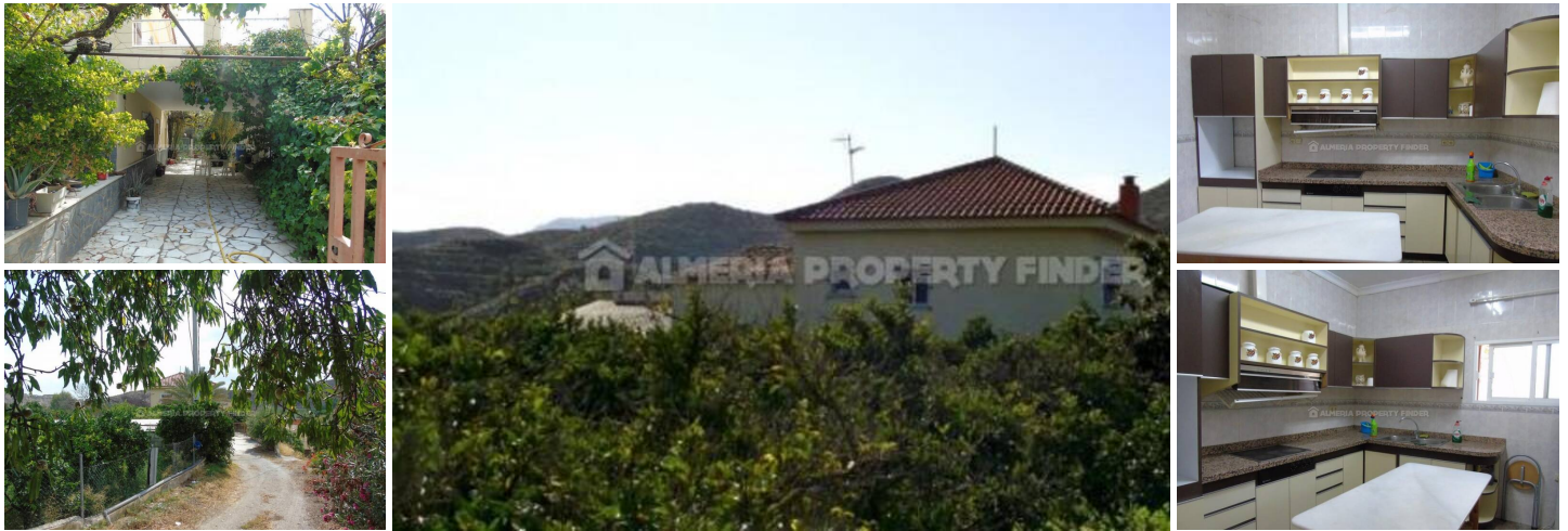
Finca de Clemente Garcia - A country house in the Olula del Rio area. (Resale)

REDUCED!! Large country property comprising a 4 bedroom main house, a separate guest annexe, two industrial buildings and a large water deposit, all set in land of around 38.000m 2 . This versatile property for sale in Almeria Province is situated between the valley towns of Olula del Rio and Purchena, both of which offer all amenities.