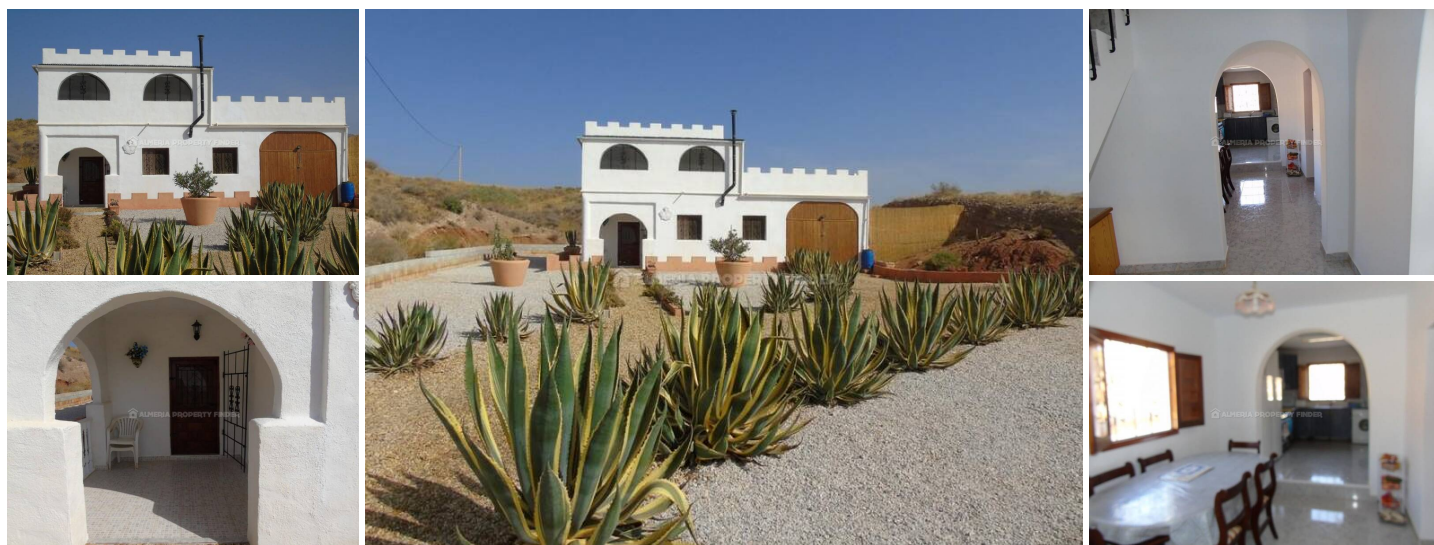
Casa Dash - A country house in the Oria area. (Resale)

Fabulous two storey 3 bedroom country house for sale in Almeria Province, situated in a tranquil rural area of Oria with fantastic far reaching views.