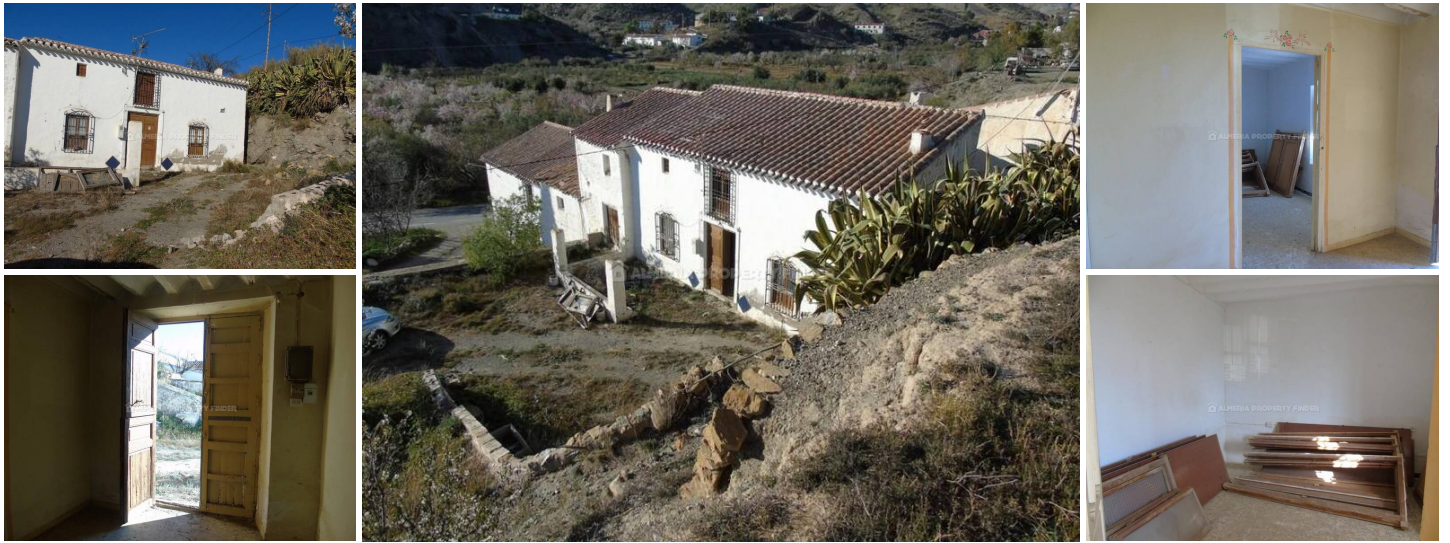
Cortijo Juanjo - A country house in the Albox area. (For Renovation)

Semi-detached 4 bedroom cortijo with garage for sale in Almeria Province, situated in the Saliente area within walking distance of a popular bar / restaurant.