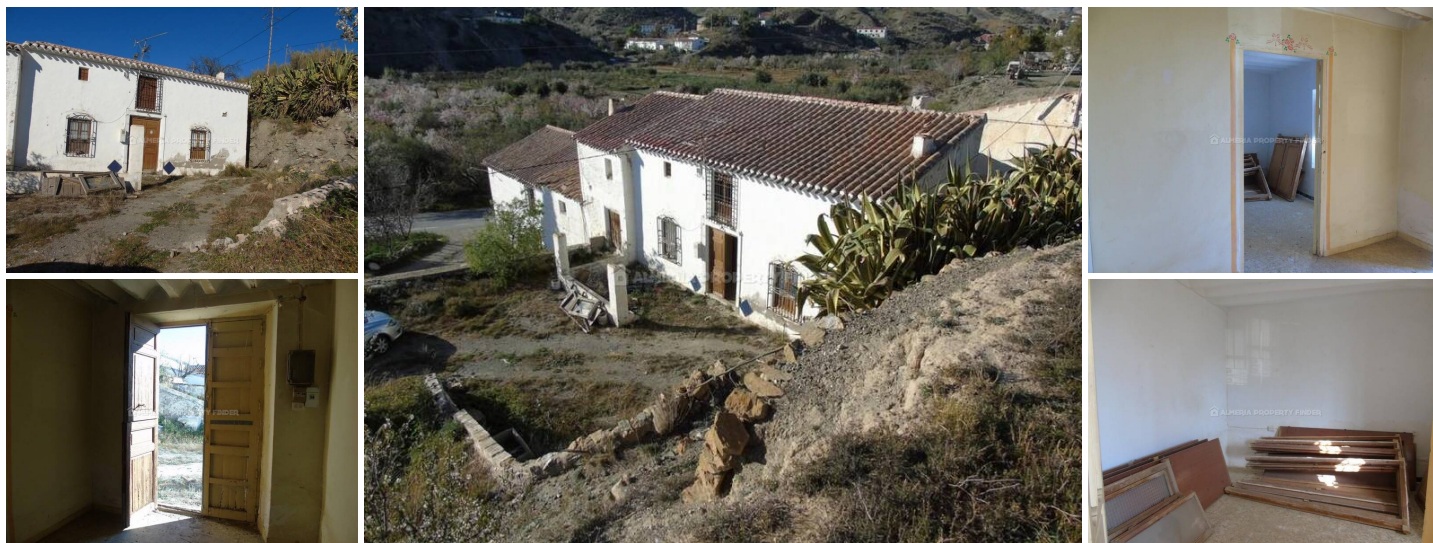
Cortijo Juanjo - A country house in the Albos area. (For Renovation)

Semi-detached 4 bedroom cortijo with garage for sale in Almeria Province, situated in the Saliente area within walking distance of a popular bar / restaurant.