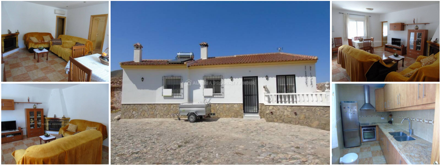
Casa de la Era - A villa in the Arboleas area. (Renovated)

Fully renovated 3 bedroom country house with large underbuild, situated around 15 minutes from the charming town of Arboleas and only 5 minutes walk from the local bar.