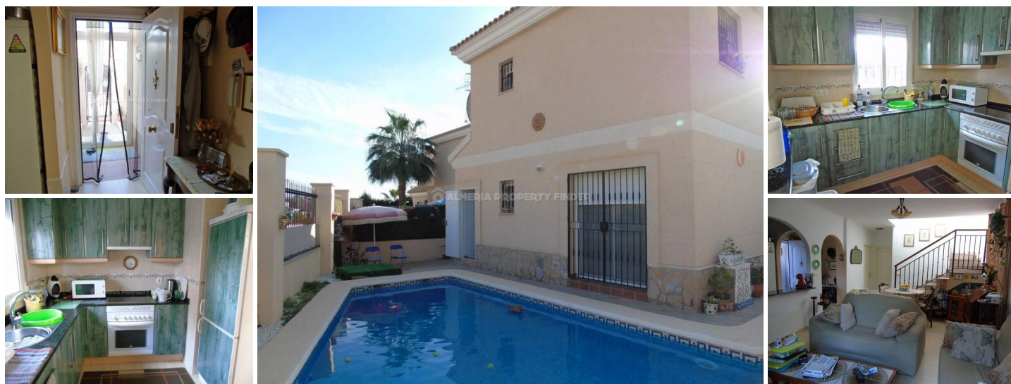
Villa Alfareros - A villa in the San Juan de los Terreros area. (Resale)

JUST REDUCED - Detached 2+ bedroom villa with private pool for sale in Almeria Province, situated in the popular coastal resort of San Juan de los Terreros. The villa is situated on a quiet street, only a short walk from the nearest bar and around 10 minutes walk from the beach and other amenities.