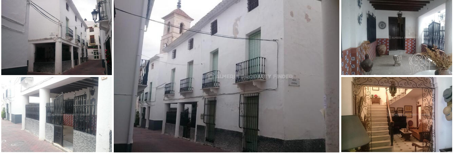
Casa Gigante - A town house in the Albánchez area. (Habitable)

Enormous 9+ bedroom townhouse for sale in Almeria, situated in the picturesque traditional Spanish town of Albánchez, close to the main square. This property would be ideal as a large family home, or for someone who would like to set up a guest house / bed & breakfast. The house has its own secure parking to the rear of the building.