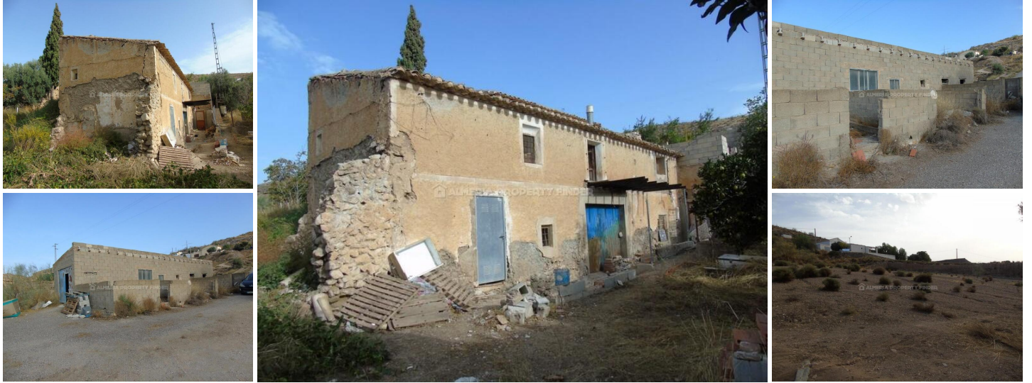
Cortijo Molino - A country house in the Albox area. (For Renovation)

A great opportunity for anyone looking for a renovation project.