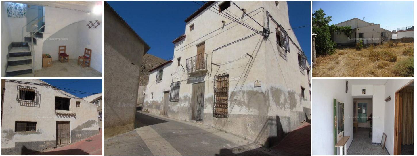
Casa Luciana - A town house in the Oria area. (Partially Reformed)