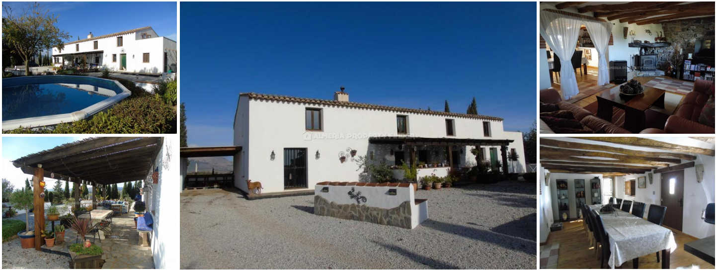
Cortijo Los Titos - A country house in the Velez Rubio area. (Renovated)