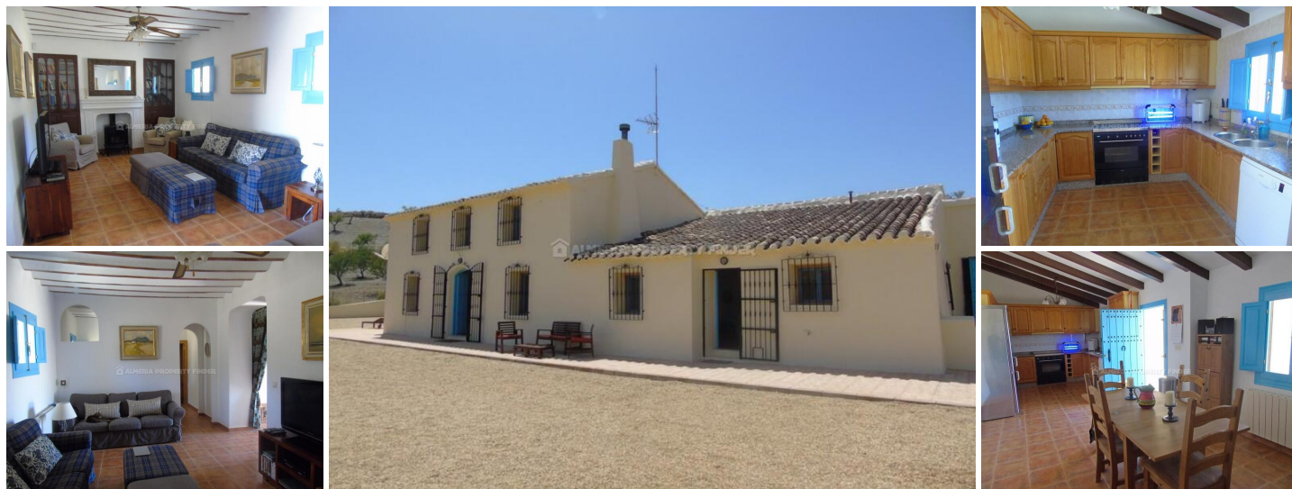
Cortijo Tornero - A country house in the Albox area. (Renovated)