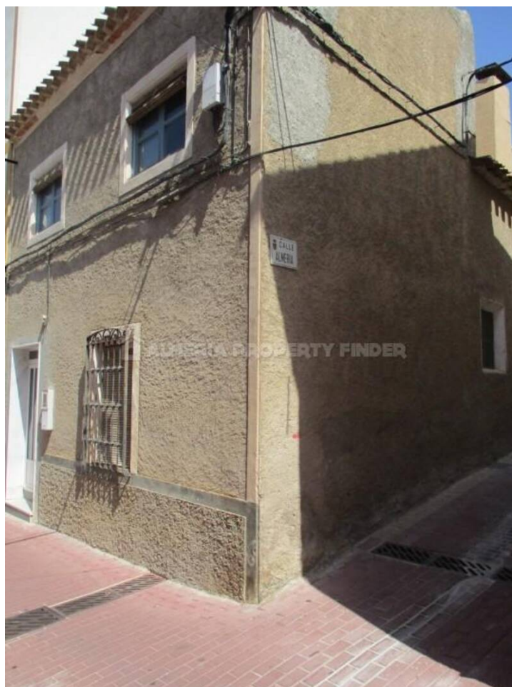
Casa del Peluquero - A town house in the Oria area. (Habitable)

Three bedroom town house for sale in Almeria Province, situated in the traditional town of Oria which offers all amenities. The property is habitable to a basic standard but in need of renovation throughout.